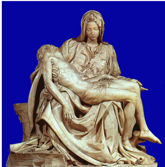
Where was Jesus when the tomb was first discovered empty? First clue see John 20:17

Where was Jesus at before Mary Magdalene saw Him? Jesus has a physical body. When Mary Magdalene went to the tomb it was empty. She went to the Apostles and He was not there. Later, she sees Him and He says that He has not yet ascended to the Father. John 20:17 To where or to whom had Jesus gone? With so many prominent individuals eliminated it doesn't seem hard to choose between Pontius Pilate and Mary.